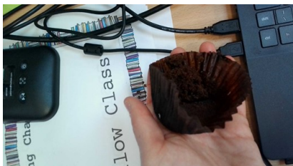
My cake gobbled up!

Addition and subtraction problems have kept us busy in maths. We have been considering what happens when we add to the ones, tens or hundreds place value columns and spotting patterns.